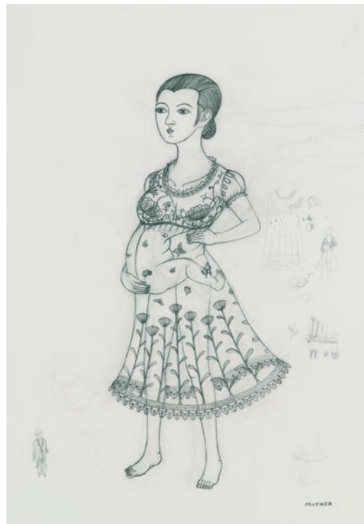
Wilson Shieh "Mother", 2007, Drawing, 70 x 48 cm