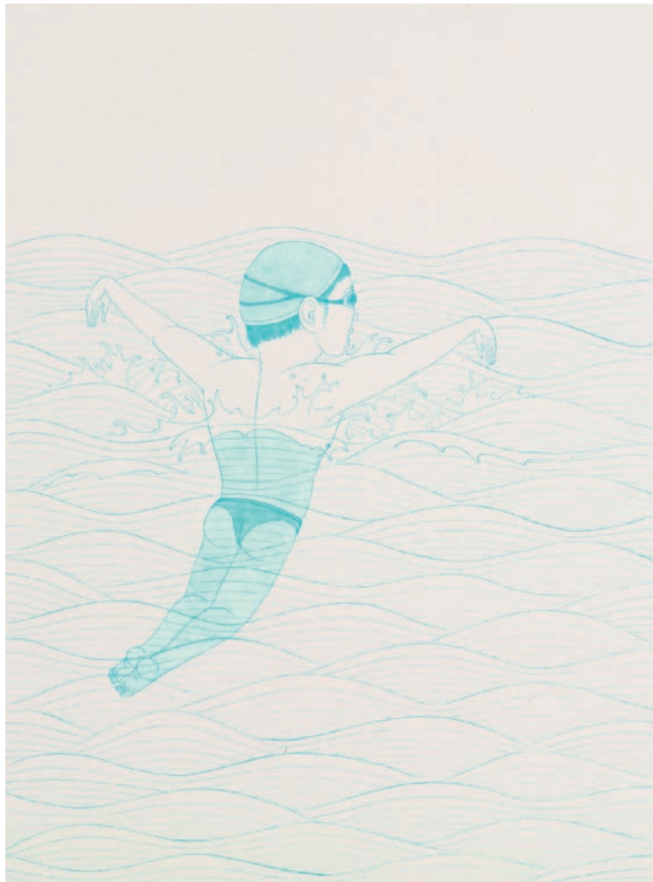
Wilson Shieh "Swimmer 4", 2007, Drawing, 84 x 86,5 cm