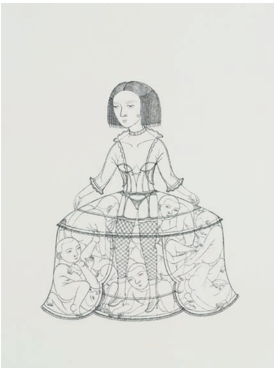
Wilson Shieh "Lady", 2007, Drawing, 68 x 51 cm

Innsbruck. His fine pencil drawings, concentrated on the line and sometimes covering the sheet like a spider's web, take their iconographic inventory from the artist's subconscious, where pornographic photographs mingle with the drawings and paintings of old masters, where film stills merge with